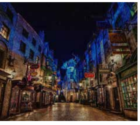
Warner Brothers "The Making of Harry Potter"