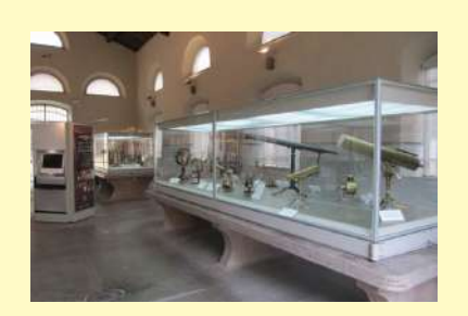
Museo degli Strumenti di Fisica