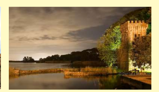
Torre del Lago Puccini