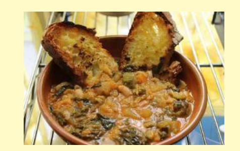
→ Ribollita bread soup