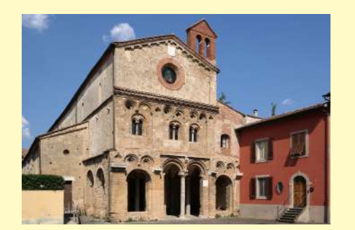
Chiesa di San Zeno