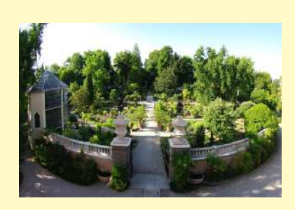
Orto e Museo Botanico