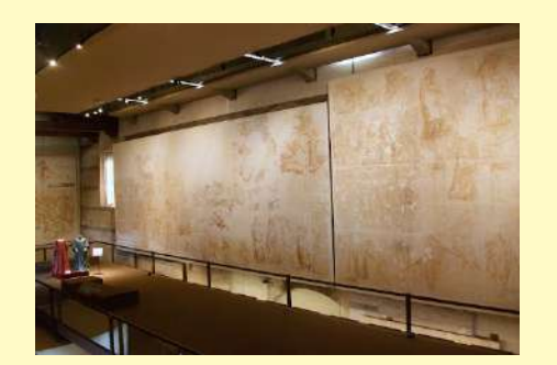
Museo delle Sinopie