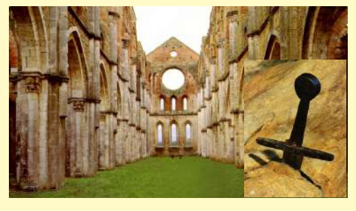
Abbazia di San Galgano