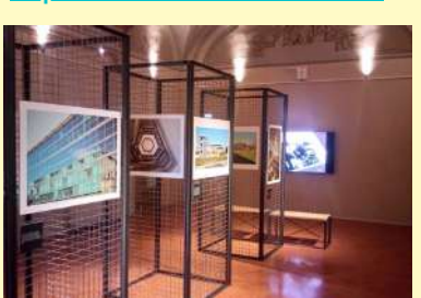
Museo della Grafica