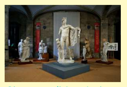
Gipsoteca di Arte Antica