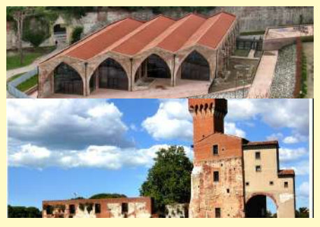
Arsenali medicei Torre della Cittadella e Cittadella Vecchia