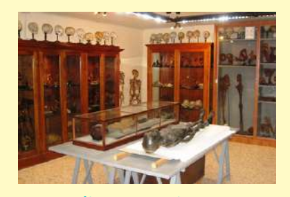
Museo di Anatomia Umana