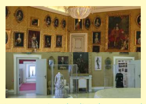
Museo Nazionale di Palazzo Reale Museo nazionale di San Matteo