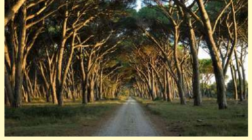
Parco di Migliarino, San Rossore e Massaciuccoli