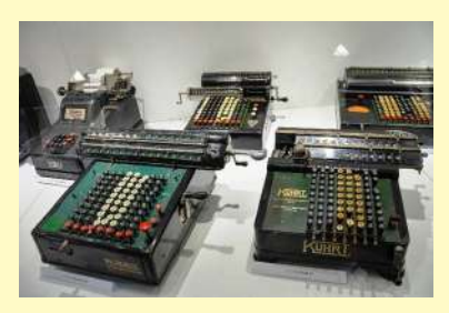
Museo degli Strumenti per il Calcolo