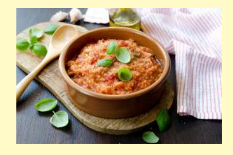
<u>Pappa al Pomodoro -</u> <u>Tomato Soup</u>