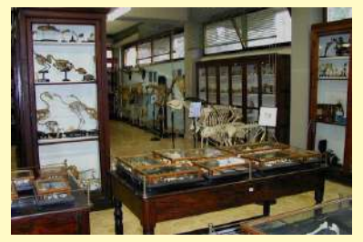
Museo Anatomico Veterinario