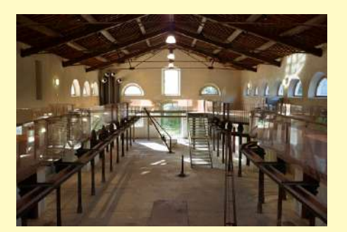
Cittadella Galileiana Ludoteca Scientifica