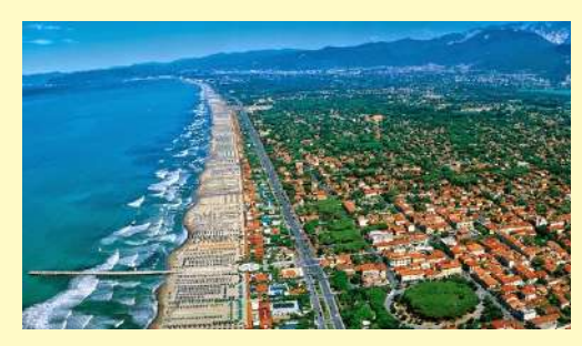
Viareggio, Forte dei Marmi, Lido di Camaiore, Pietrasanta