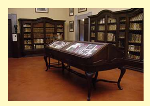
Domus Galilaeana (fondazione)