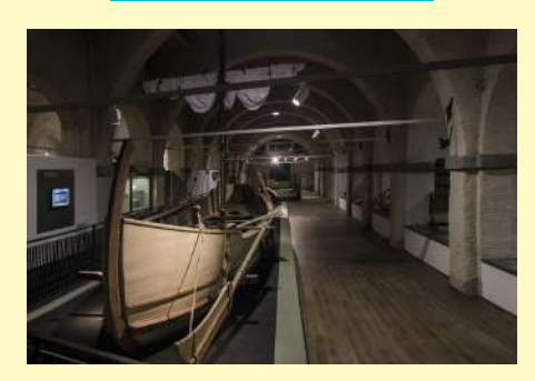
Museo delle Navi Antiche di Pisa