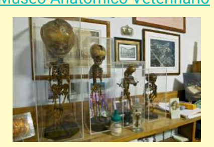
Museo di Anatomia Patologica