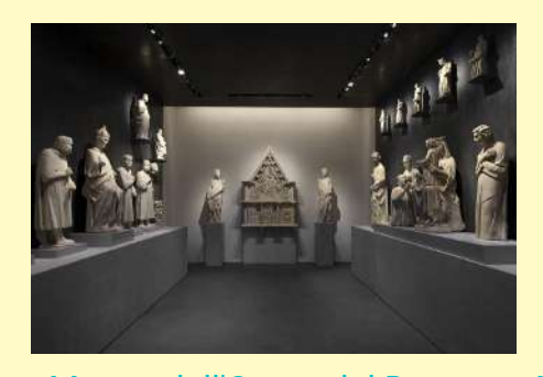
Museo dell'Opera del Duomo